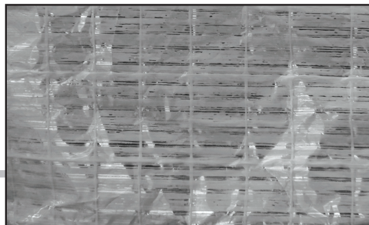
(Close-up of Tri-Directional Scrim)